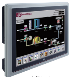
▲ Side view