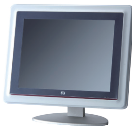
▲ Desktop stand