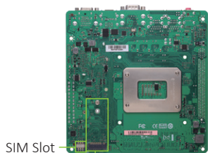
SIM Slot M.2 Key B ▲ Rear view (2242/3042/3052)