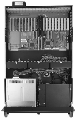
▲ Top view