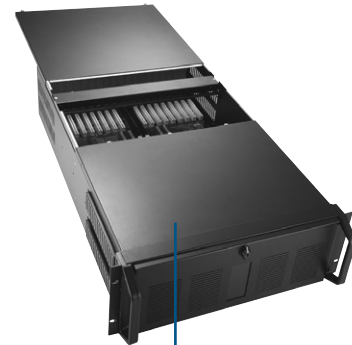
Dual top cover design for easy maintenance