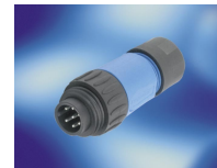
View represents all available contact positions.