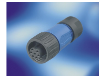
View represents all available contact positions.