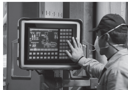
▲ Ideal for factory automation & self-service kiosk in retail