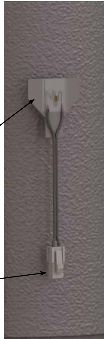
Placement on Water Heater Tank

The sensors are designed to work in predominantly dry environments and are particularly suited for domestic applications where they can be positioned between the water tank and an insulating jacket as shown. The sensors should NOT be used externally where they can be subjected to wind, rain and direct sun.